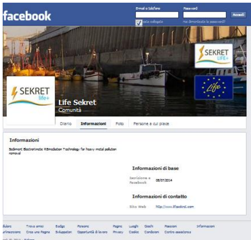
Figure 2: Example of the information section