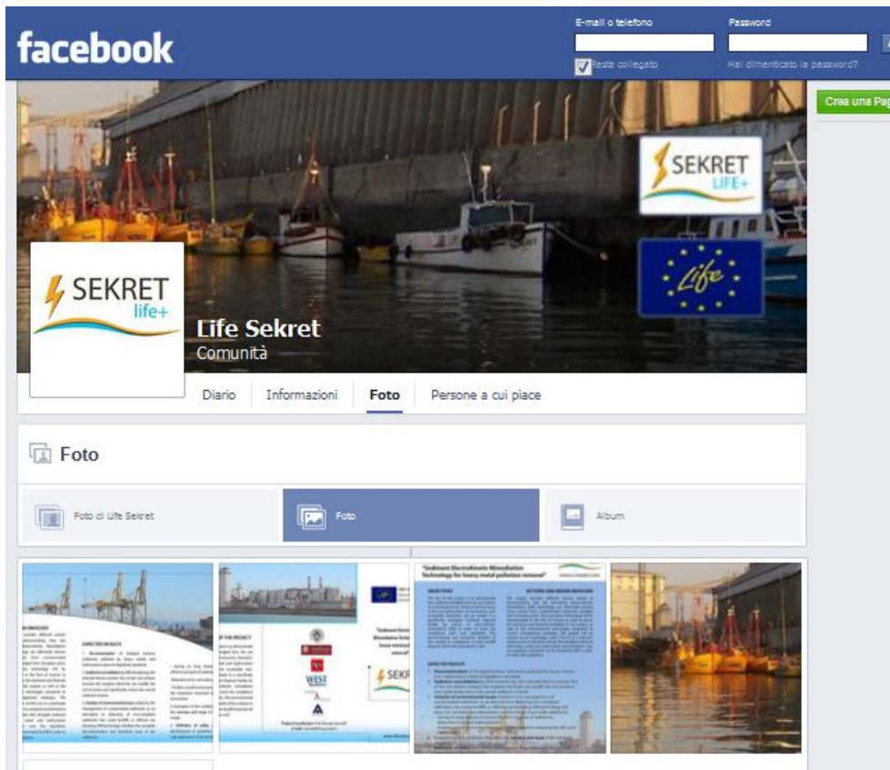
Figure 3: Example of the photos section