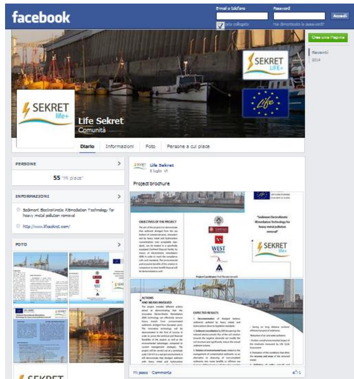
Figura 1 SEKRET Facebook Homepage